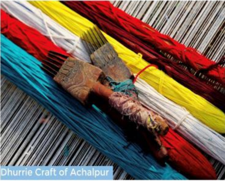
Dhurrie Craft of Achalpur